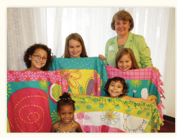
A group of Beloit youngsters were inspired by a "Friends for Change" TV commercial. It gave them the idea to cut and knot these seven brightly colored blankets and donate them to hospitalized children.

"The golf Pro-Am has raised over $1.7 million in proceeds over the past 27 years. Thanks to our supporters, these funds have helped purchase important equipment from a surgery camera to a new MRI."