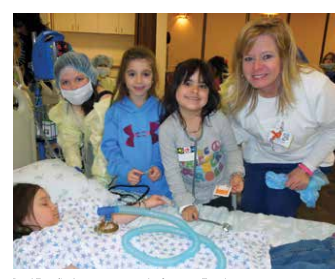
Local First Graders participate in the Operation Timothy program where they come to the hospital to take turns being doctors, nurses and patients to help inspire future caregivers.