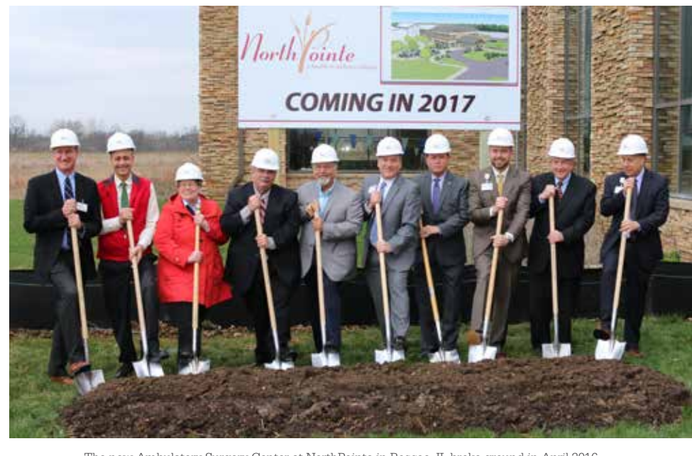
The new Ambulatory Surgery Center at NorthPointe in Roscoe, IL broke ground in April 2016. The new Center will add over 30,000 sq. feet of new space to add surgical services for orthopaedic, ophthalmology and gastroenterology procedures.