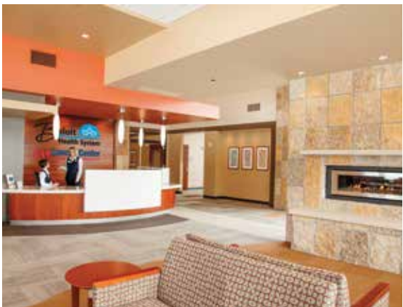
The beautiful, new Beloit-UW Cancer Center opened in December and is now caring for patients from three counties with the latest in technology.