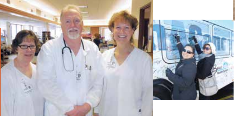
sitors to the Cancer Center open houses had an opportunity to sign their names on the aveling city bus as "cancer fighters."