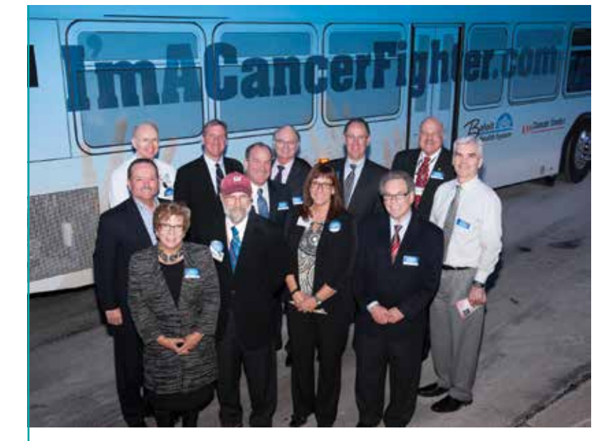
Beloit and University of Wisconsin leadership share expertise for the best cancer outcomes at the new, $11.6 million Cancer Center.