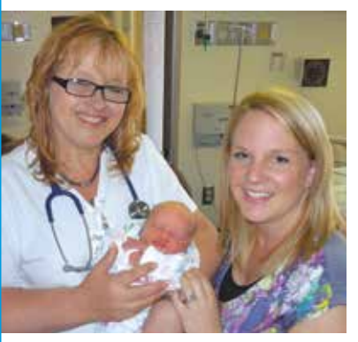
New moms in the Birthing Center return some of the highest patient satisfaction surveys.

A 2013 Consumer Reports survey ranked Beloit Health System as one of the top hospitals in surgical excellence and safety.